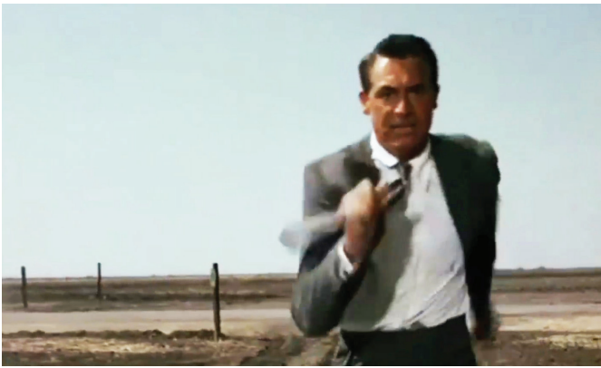
“North by Northwest, North by Northwest”, Felipe Steinberg (Brazil), 2012. HD Video, 3:50 min.

“North by Northwest, North by Northwest” is adapted for the screen from a video-sculpture. The first part of the video is an appropriated footage from the inauguration of the World Trade Center, with an edited compilation of all aerial shots. The second part is the airplane chase in the desert scene from “North By Northwest” from Alfred Hitchcock without the plane erased frame by frame.