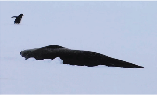
“Where To?”, Demet Taspinar (Turkey), 2009. HD Video, 6:29 min.

“Where To” explores landscapes that are on the verge between what is real and unreal. They facilitate an act of reconciling on the significance of nature as a composite that is not all in itself, solely, but within the relationship between the parts. Taspinar’s minimal and contemplative approach gives us time to think about a world that is in balance with all living beings. Her work is a hopeful reflection but also makes us aware of what is meaningful in life.