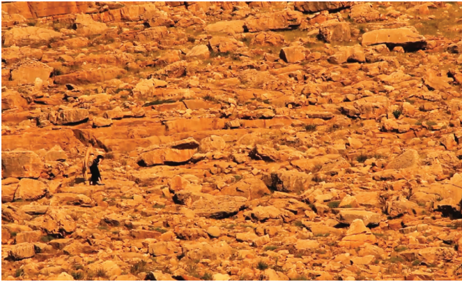
We Both Know. Noor Abed (Palestine), 2013. HD Video, 9:15 min (short version presented 4 min.)

“We Both Know” examines concepts of death and gender in relation to the landscape in the frame of time and labor. It also plays out fantasies of endurance as articulated through the space of the body. Here, the body is a colonized one; unpacking ideas of control within the political realm through the personal. The work questions concepts of camouflage and repetition through naturalized body movements, while contemplating the present moment.